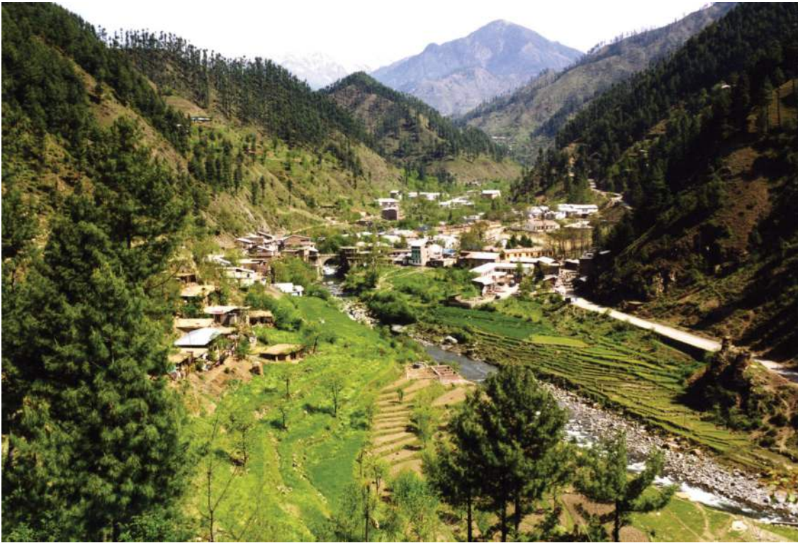
Photograph C for Question 3