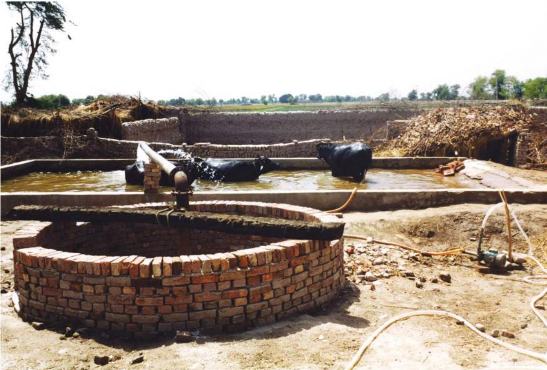
Photograph B for Question 2