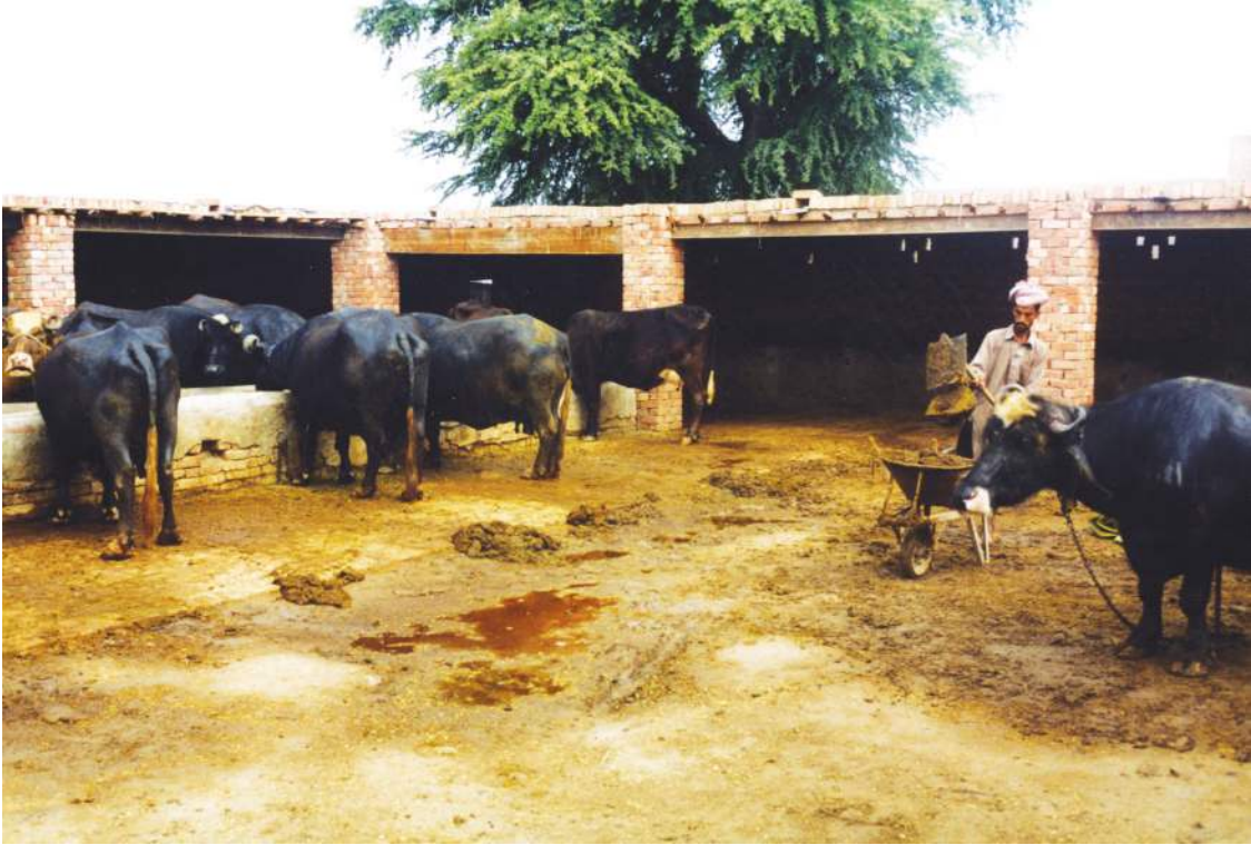
Photograph A for Question 2